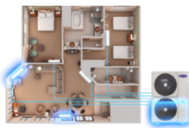
Carrier 10kW CDU with upto 5 FCU Combination