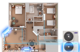
Carrier 8kW CDU with upto 4 FCU Combination

The Carrier Multi-Split system provides cooling and heating similar to a single split system, in an energy-efficient way. In the Carrier Multi, the maximum combination can go up to 130%, which helps to save both cost and space.